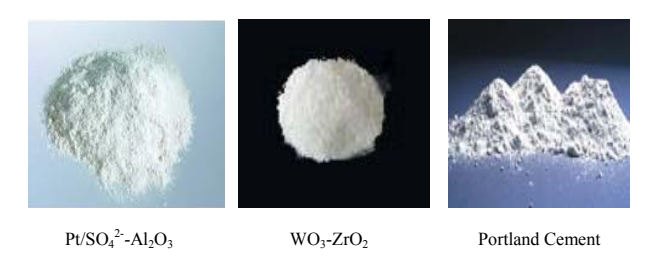
Figure 1. The picture of powdered samples

The WO<sub>3</sub>-ZrO<sub>2</sub> sample was prepared by impregnation of Zr(OH)<sub>4</sub> with aqueous solution of ammonium metatungstate (NH<sub>4</sub>)<sub>6</sub>[H<sub>2</sub>W<sub>12</sub>O<sub>40</sub>], followed by drying at 383 K overnight and calcinations at 1093 K for 3 h in air [5]. The content of WO<sub>3</sub> was 13 wt%. Zirconium hydroxide Zr(OH)<sub>4</sub> was prepared by titration of zirconium oxychloride (ZrOCl<sub>2</sub>·8H<sub>2</sub>O) (Wako) with ammonia (NH<sub>3</sub>) solution (Merck) [5]. 50 g of zirconium oxychloride was dissolved with 2.5 L of doubly distilled water. Then, 2.8 % of ammonia solution was added dropwise by titration method up to pH 8 at 353 K under vigorous stirring. colloidal precipitate was formed at pH 7. Then, 28 % of ammonia solution was added again dropwise by titration method up to pH 10 at 353 K with vigorous stirring. Then the precipitated hydrogel was aged for 6 h at this temperature. The solution was decanted with deionizeddistilled water at room temperature until the pH of solution becomes 7. The zirconium hydroxide precipitate obtained was filtered and dried at 383 K overnight in air. Ammonium metatungstate solution was prepared by the reaction of tungsten oxide (Wako) with ammomiun solution (Merck) at 353 K.