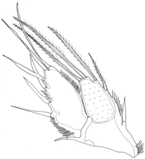
Fig. 3. Laophonte cornuta , female. P5