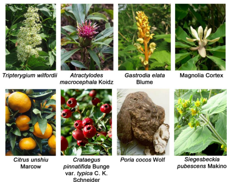
Fig. 2 Potential herbs that can be used for DES coating.